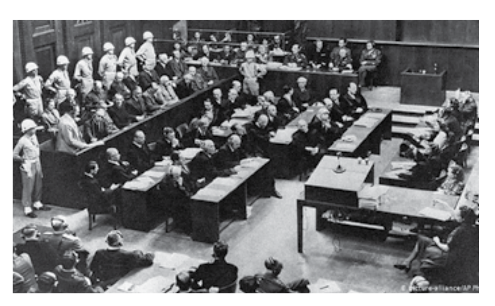
1947: Nuremberg trial of Nazi doctors who experimented on prisoners in concentration camps

It is also a well-settled legal doctrine under federal law that medical experiments must detail the benefits and