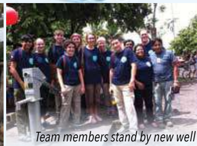
Team members stand by new well

Did you know that whenever you refer a friend to Hotze Health & Wellness Center, we make a donation to Living Water?