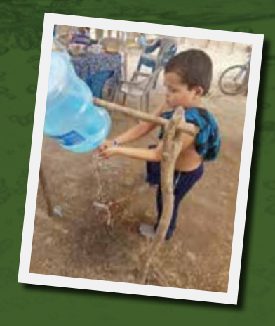
Because of the faithfulness of Living Water donors, this El Salvadorian community received a well, learned about the importance of safe hygiene and sanitation, and heard God's plan of salvation!