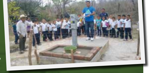
The residents of Santa Lucía Orcoyo were thrilled to receive safe water.